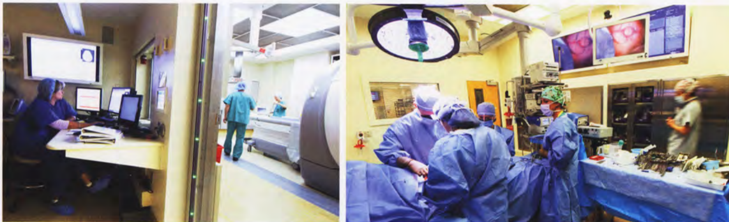
(Left) A single control room allows radiology technicians to monitor CIGI's two MRIs. One MRI has a wide bore, or opening, so that interventional radiologists can perform minimally invasive procedures while the device takes real-time images. (Right) The Surgical Day Hospital's seven new operating rooms are equipped with ceiling mounted "booms" supplying oxygen, anesthesia, and suction, as well as the flat-panel "Walls of Knowledge," which provide patient data and offer videoconferencing capabilities with other operating rooms.

A vision of creating a state-of-the-art treatment center in which multiple medical disciplines would practice in close proximity to one another became a reality on June 7 when MSKCC opened a facility housing the novel Center for Image-Guided Interventions (CIGI), a suite of endoscopy rooms, and new operating rooms for the Surgical Day Hospital (SDH).