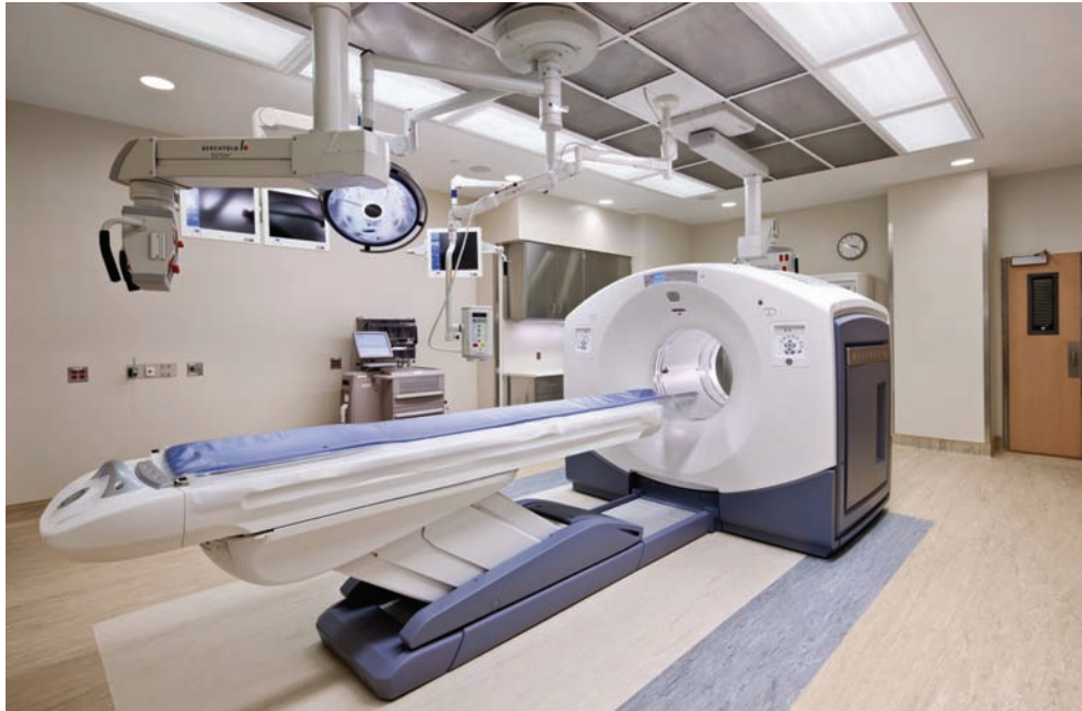
PET/CT Hybrid OR