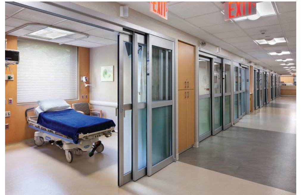
Pre/Post Op Private Patient Rooms

The Pre and Post Op area contains private rooms with views and abundant natural light for each patient. The area was planned to minimize patient movement during a visit and provide privacy for discussions between patients and staff.