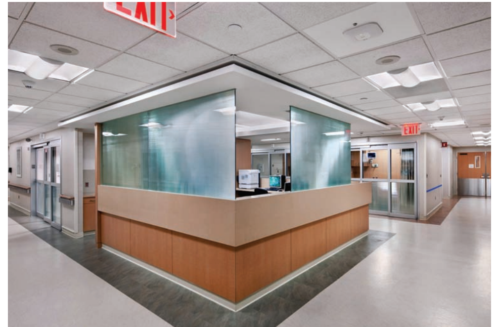
Pre/Post Op Clinicians Station

In this ambulatory care setting where patients walk to their procedures often accompanied by family members in the Pre and Post Op area, special attention was given to the design of work areas that provide quiet and privacy for the staff as well as opportunities for oversight and access by the patient.