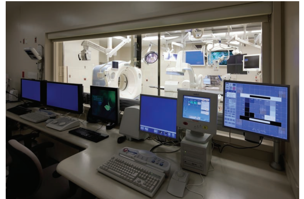
View to Angio/CT OR2 from Common Control Room

Common control areas are planned for consistent interface and control orientations. Similar rooms are always planned to minimize differences and reduce errors.