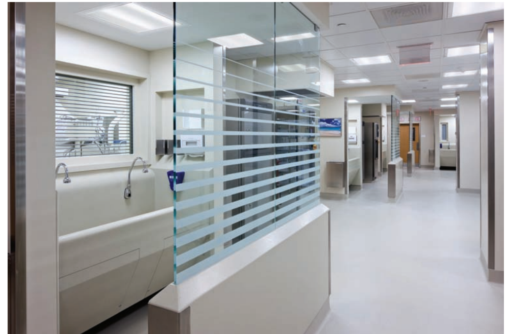
OR Clean Core and Work Room