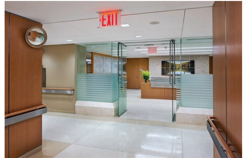
Entrance to Reception Area

The entrance to this facility was placed close to the front door of the hospital. It contains quiet spaces for waiting and private rooms for consultations, meetings and interviews between patients and staff.