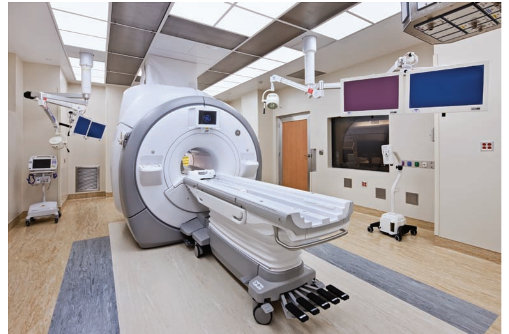
3.0T Interventional MRI OR