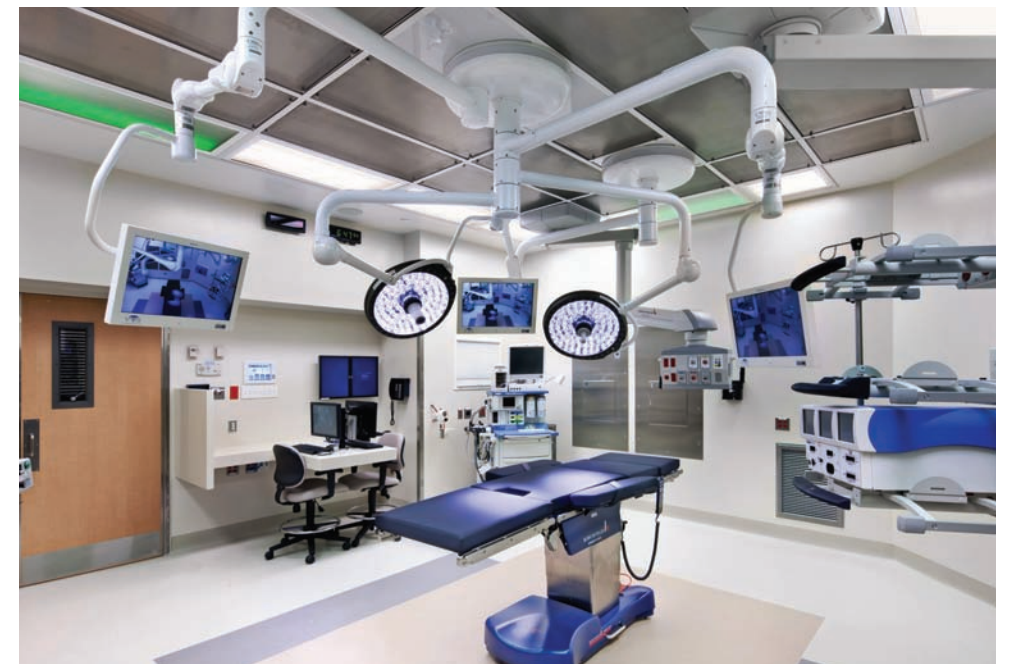
Typical MIS/General OR