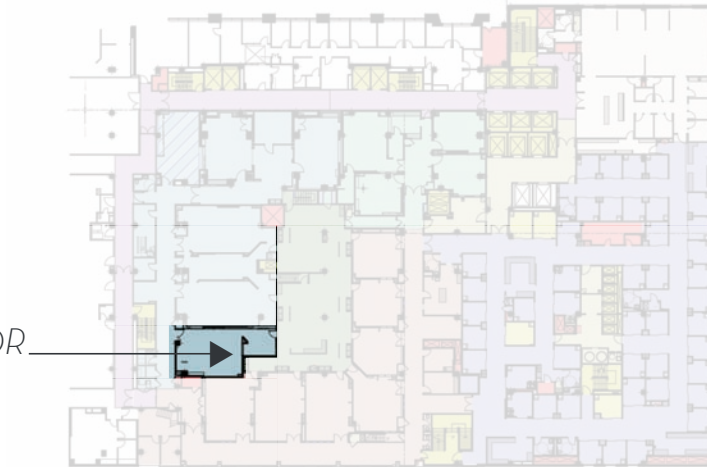
PET/CT Hybrid OR

The OR sterile environment and systems are adapted to provide OR interventional support and the standard working process for staff for diagnostic equipment such as the latest model GE PET/CT and MR.