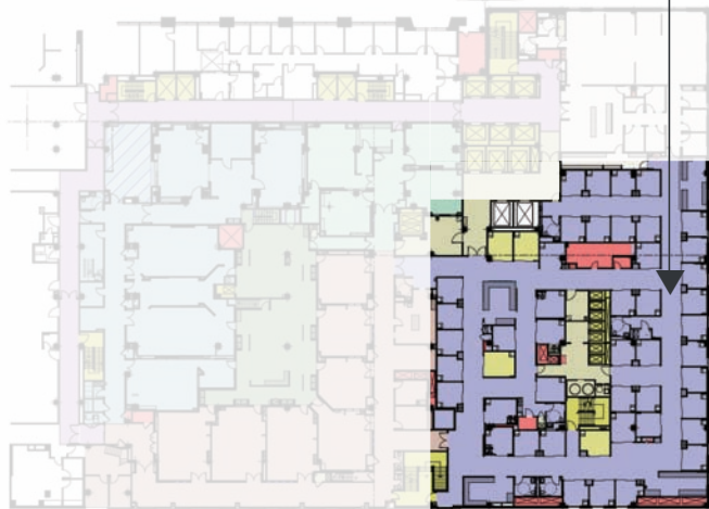
Pre/Post Op Private Patient Rooms

The Pre and Post Op area contains private rooms with views and abundant natural light for each patient. The area was planned to minimize patient movement during a visit and provide privacy for discussions between patients and staff.